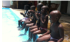
SERIOUS SWIMMING 2 COACHES PROVIDE TRAINING