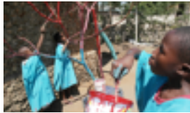
MONTESSORI-STYLE PAINTING TREES, VERTICAL GARDENS