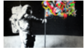
DONATED ART MORE PICS READY FOR EBAY AUCTION