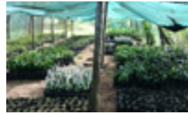
MONEY HONEY EXPLORING IDEAS TO GENERATE INCOME